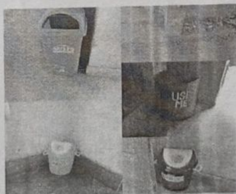
Solid waste segregation